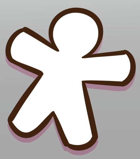
Jesus Is Born